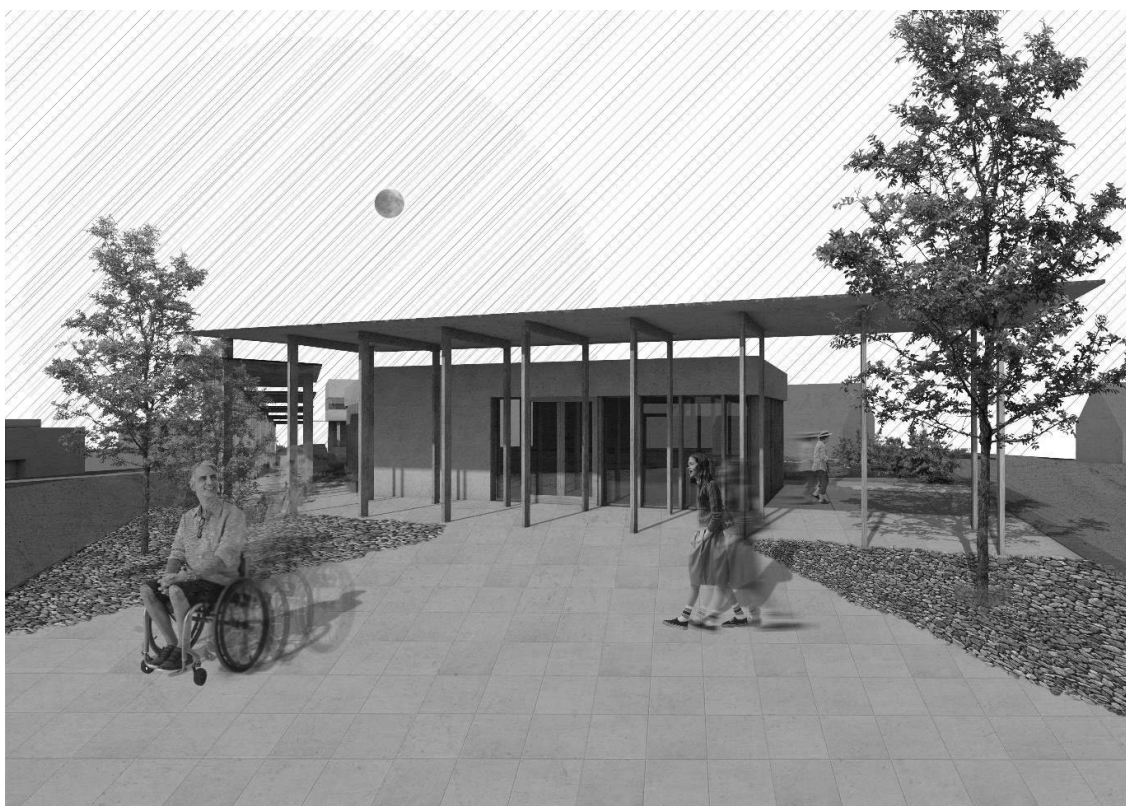
Figure 3. Possible view in front of the Shop-community area- the author's own work