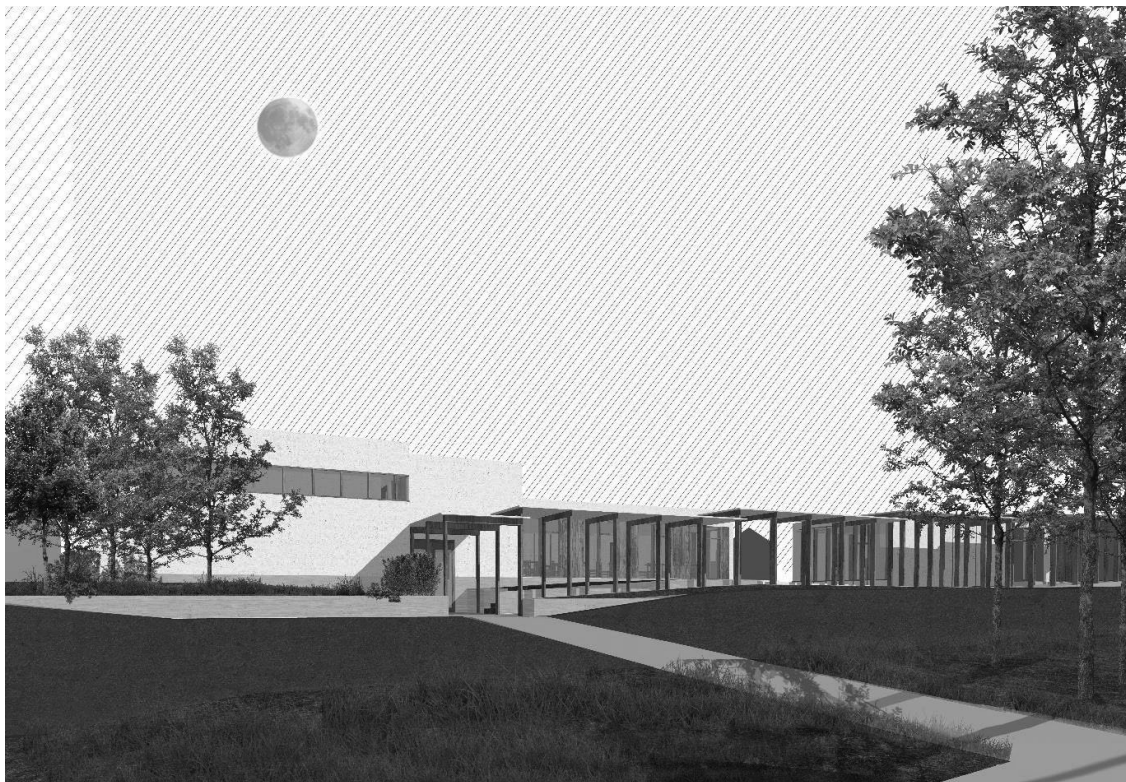
Figure 2. Planned view from the 'Co-housing'- the author's own work